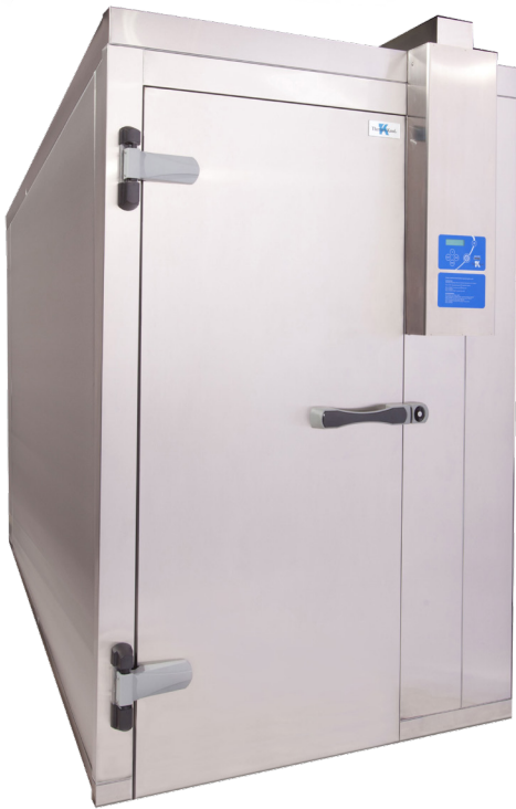
TK26BC-1 & 2